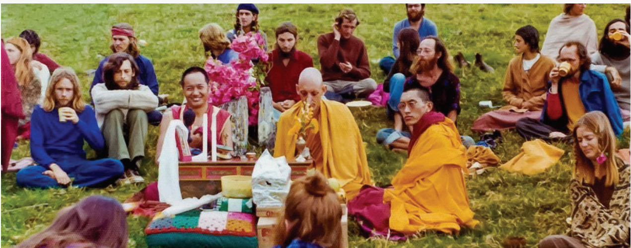
Founders of Chenrezig Institute - Lama Yeshe on the left, Lama Zopa Rinpoche on the right

Chenrezig Institute was the foundational centre for the international Tibetan Buddhist organisation, The Foundation for the Preservation of the Mahayana Tradition (FPMT) Tibetan masters Lama Thubten Yeshe and Lama Zopa Rinpoche founded the organisation.