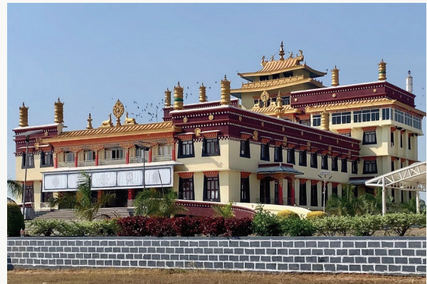
For illustration only – Tashi Lhunpo Monastery, India